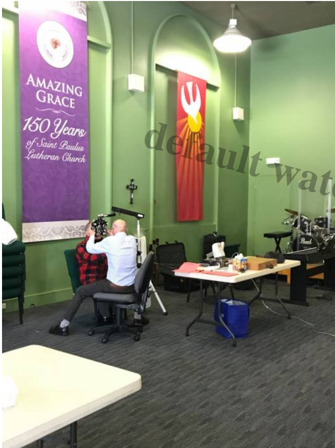
Vision testing at St. Paulus Church on Polk Street.

St. Paulus Church , at 1541 Polk St., offers free eye exams, frames and lenses on the first Tuesday of every month from 10 a.m. to 4 p.m. No appointment necessary.