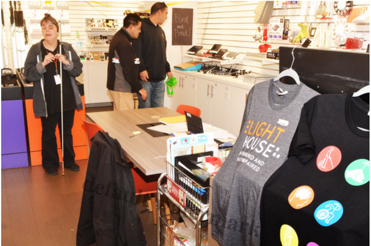
The Adaptations shop has a host of devices and aids for a wide range of vision issues.

Fortunately, there are a number of organizations in San Francisco that exist to help people with low vision to no vision. The most well-known is Lighthouse for the Blind . Founded in 1902, it promotes independence, equality and self-reliance by offering assistance for all gradations of visual impairment, from mild myopia to difficulty seeing shapes and colors to the inability to see light, the definition of blindness.