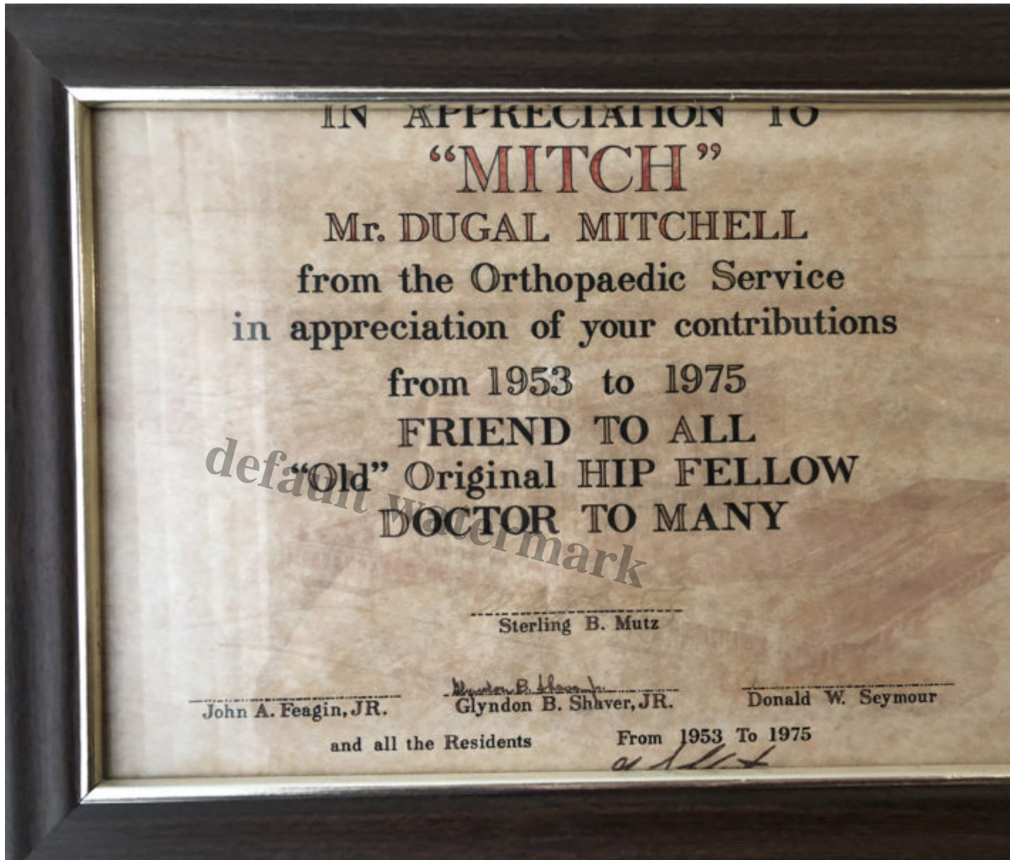
Appreciation for 22 years of service at Letterman Hospital.