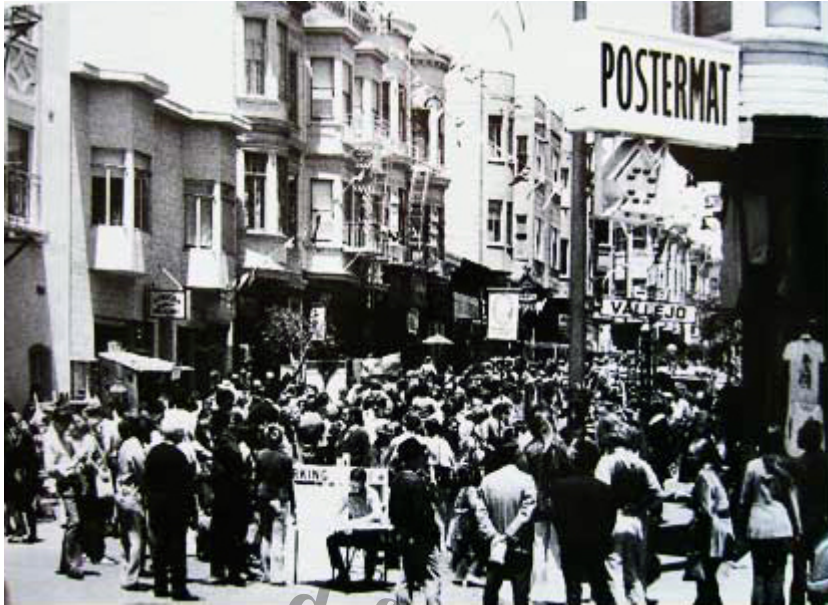
The Poster Mat in the 1970s.