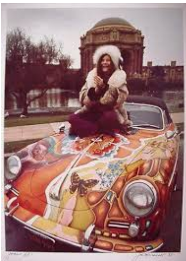
Janis Joplin in San Francisco.