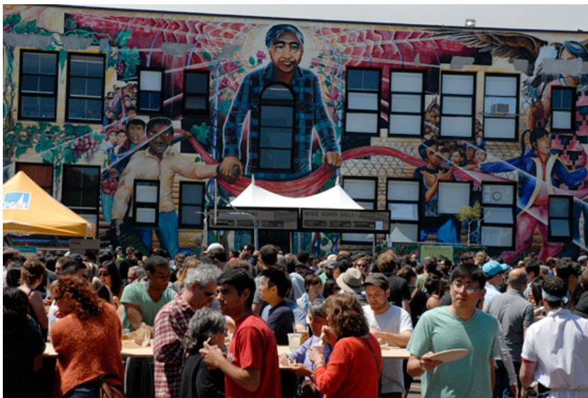
Cesar Chavez Elementary School.