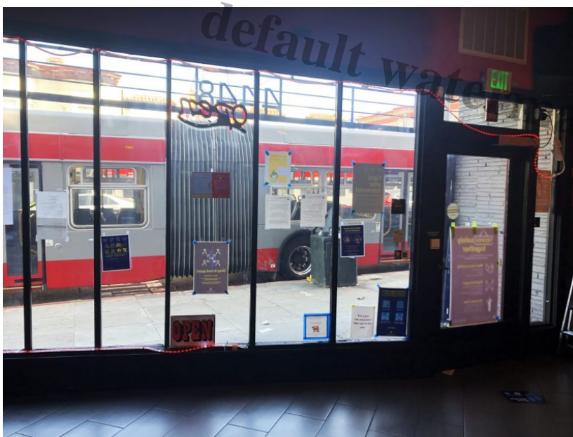
A busy bus stop makes an outdoor parklet for diners impractical.

When restaurants and many other businesses were prohibited from allowing customers inside, Rivera was forced to reduce hours and cut staff down to three — herself, the cook and the dishwasher. She couldn't build an outdoor parklet as many restaurants did; Golden State Grill's front door opens onto a narrow sidewalk and busy bus stop. She relied on takeout and sales through delivery services like DoorDash and GrubHub. "Some days, we took in only $50 or $100 but still had to pay rent and salaries," said Rivera.