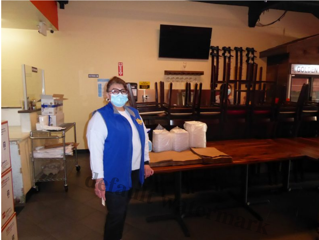
Tables, chairs and barstools have all been rearranged to make room for packaging meals for SF New Deal.

Their field armies of small and mid-size local restaurants and food trucks prepare and deliver three free meals a day, seven days a week to individuals, residential shelters, congregate housing and churches. SF New Deal has funneled direct financial aid to 184 small businesses since last March. (They currently have 111 restaurants signed up.) Off the Grid has provided assistance to 73 local restaurants and food truck operators in San Francisco.