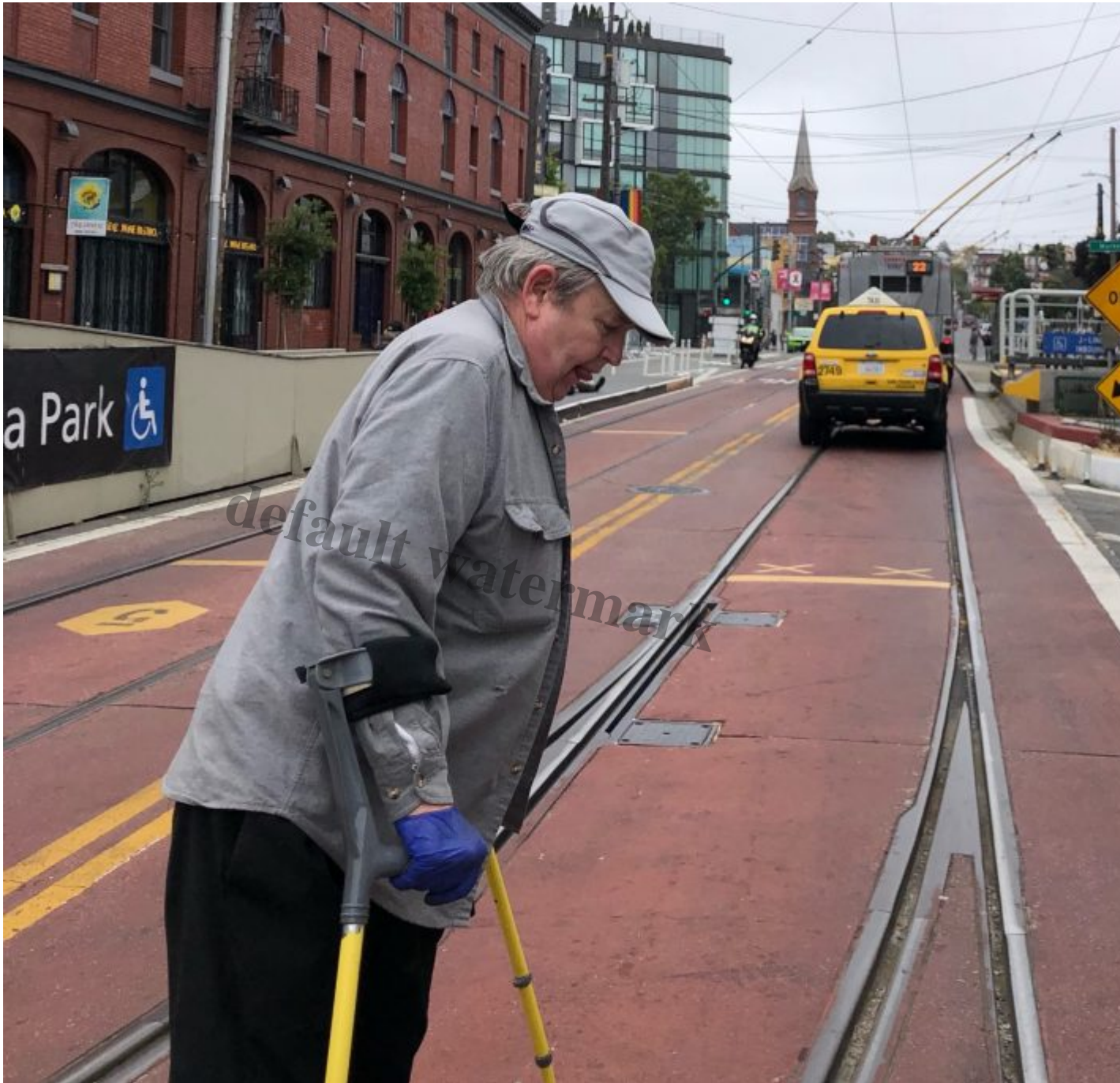
Planthold, who uses crutches, has to carefully navigate crossing streets with rail tracks.

“When Bicycle Coalition members speak before a government board, they can say ‘I’m so-and-so from the Bicycle Coalition and we’re 12,000 strong,’” Planthold said. That’s a strong, implicit threat — one that translates into votes, campaign dollars and volunteers.