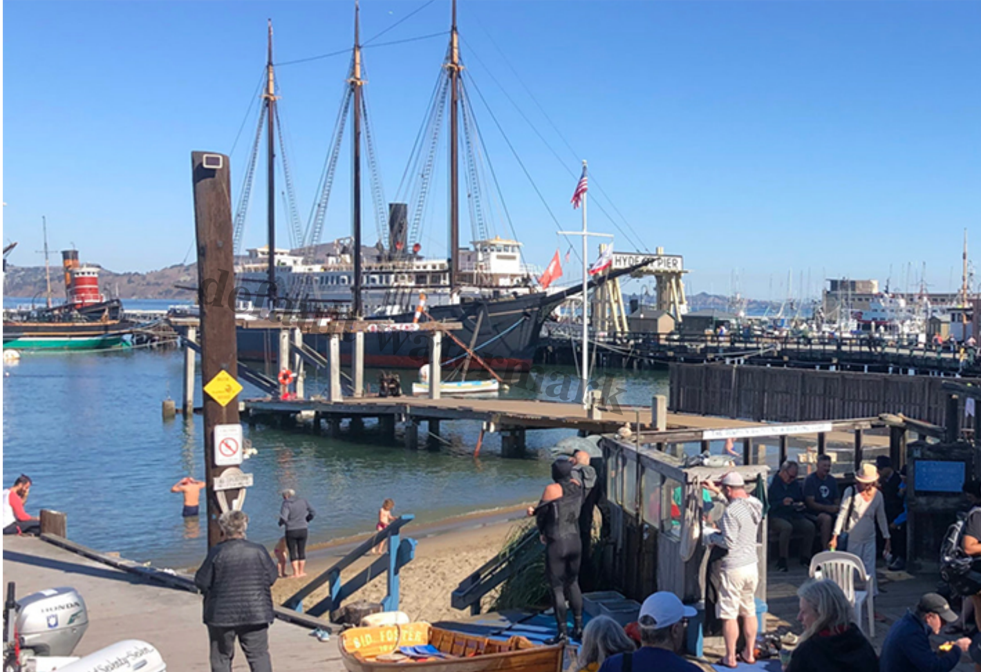
Bayside at the Dolphin Club.

The club attracts people of all ages, ethnicity, religions and classes. You can be eccentric here, Hollister said, a welcome change from the class-conscious rigidity of his small-town boyhood.