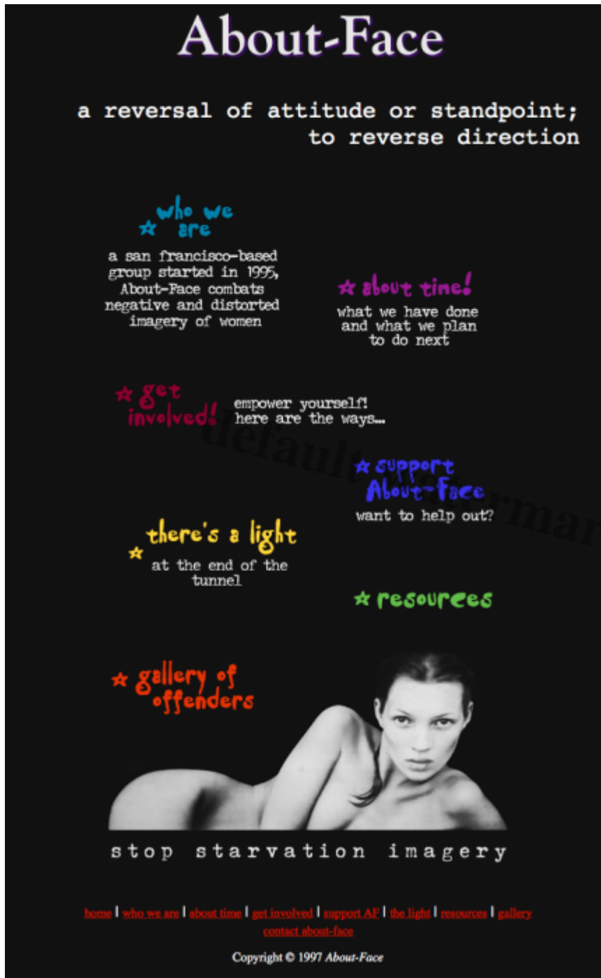
An early About-Face website.

â??The image reinforced a sexualization of young women and just as those sisters I stood near in line and all young women started to develop the physical characteristics of womanhood â?? breasts, hips, fleshier everything â?? there were constant images suggesting that what really mattered was staying young, thin, prepubescent,â?• she said. â??It all made me incredibly angry.â?•