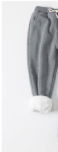
Regular Fit Pla...