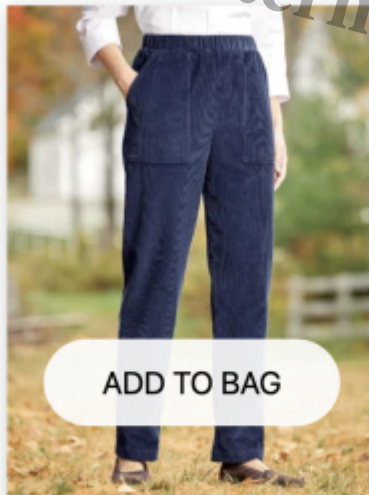
Wide-Wale Corduroy Pull...

turn-micro-elasticity-daily-loose-elastic-band-t-line-regular-casual-pants-14359730?variant=2667255 $36.99