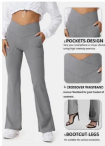
Women Casual Plain Autu...

turn-micro-elasticity-daily-loose-elastic-band-t-line-regular-casual-pants-14359730?variant=2667255 $36.99