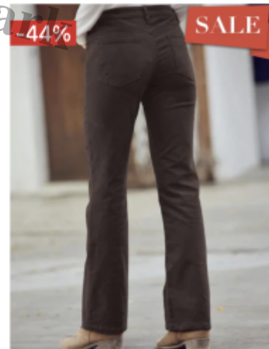
Corduroy pocket zipper fit...