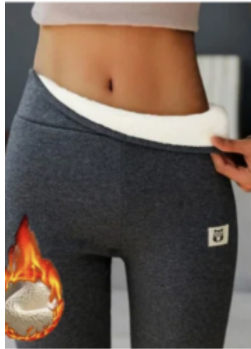
Casual Fleece Lined High ...