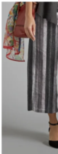
Casual Loose S...