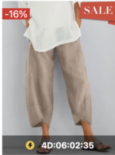
Women Cotton Pants Sum...