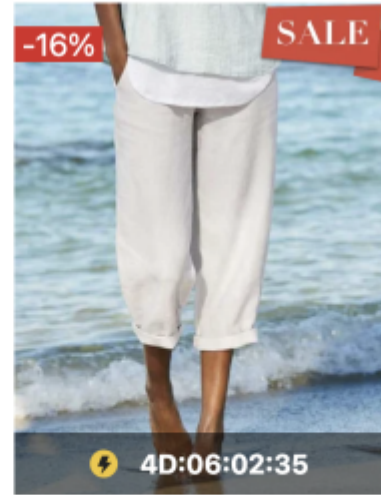
Elastic Waist Paneled Line...