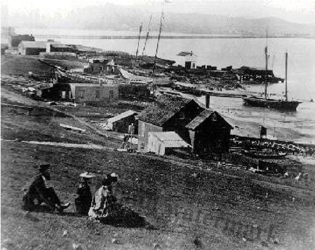
The Bayview District was once an Italian and Maltese enclave southwest of Third Street. This 1866 photo looks northwest across Islais Creek.