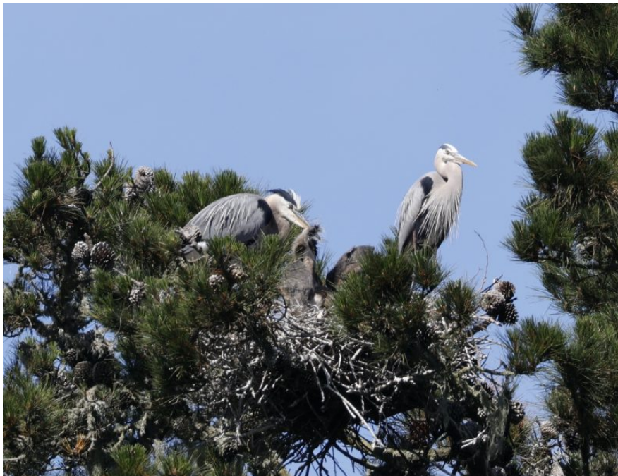
Great Blue Herons at the former Stow Lake.