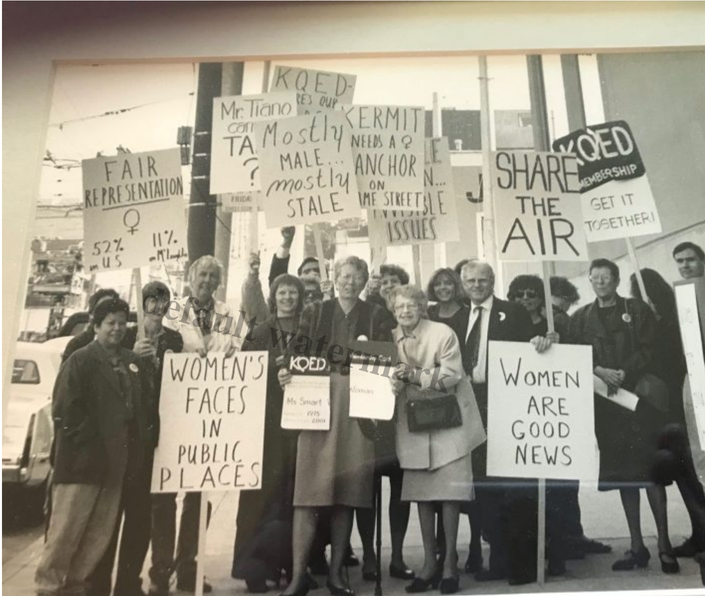
A protest in November 1991 in front of KQED's Mariposa Street headquarters pushing for better representation of women and people of color among news presenters.

The event was reported by the Associated Press in media across the country, along with pictures and her demand that all news programming include 50 percent women and people of color. She campaigned across the U.S. and got valuable advice from Gloria Steinem, whom she called "the consummate organizer and kindest mentor I've had."