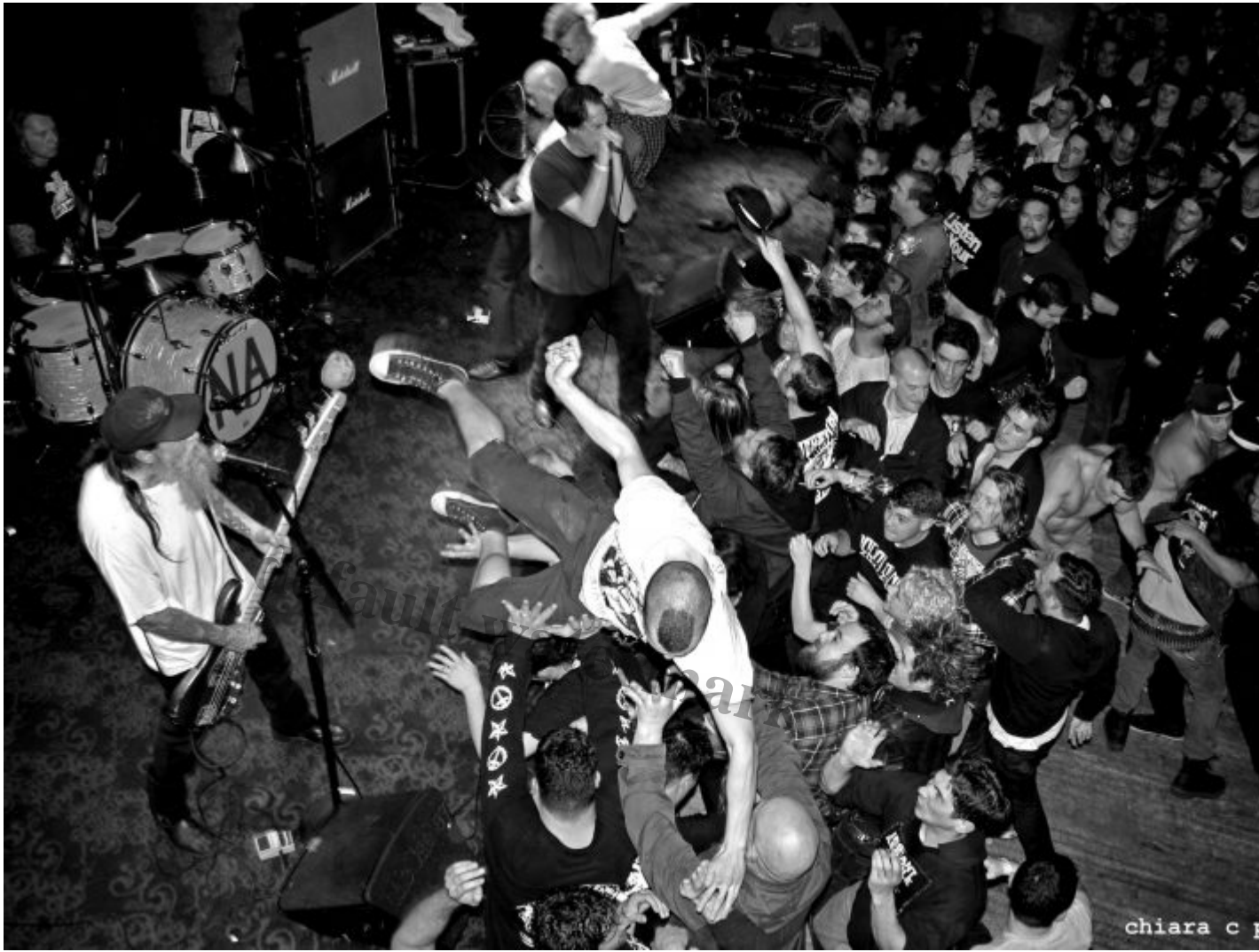
The Dead Kennedys at the Mabuhay Gardens.