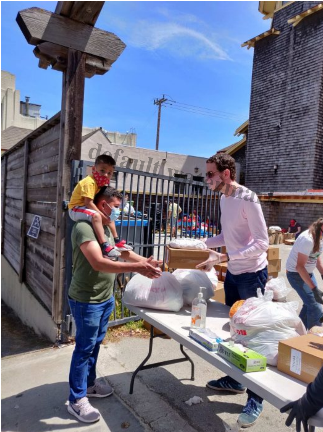
Handing out food packages at St. Gregory's Food Pantry on Potrero Hill.