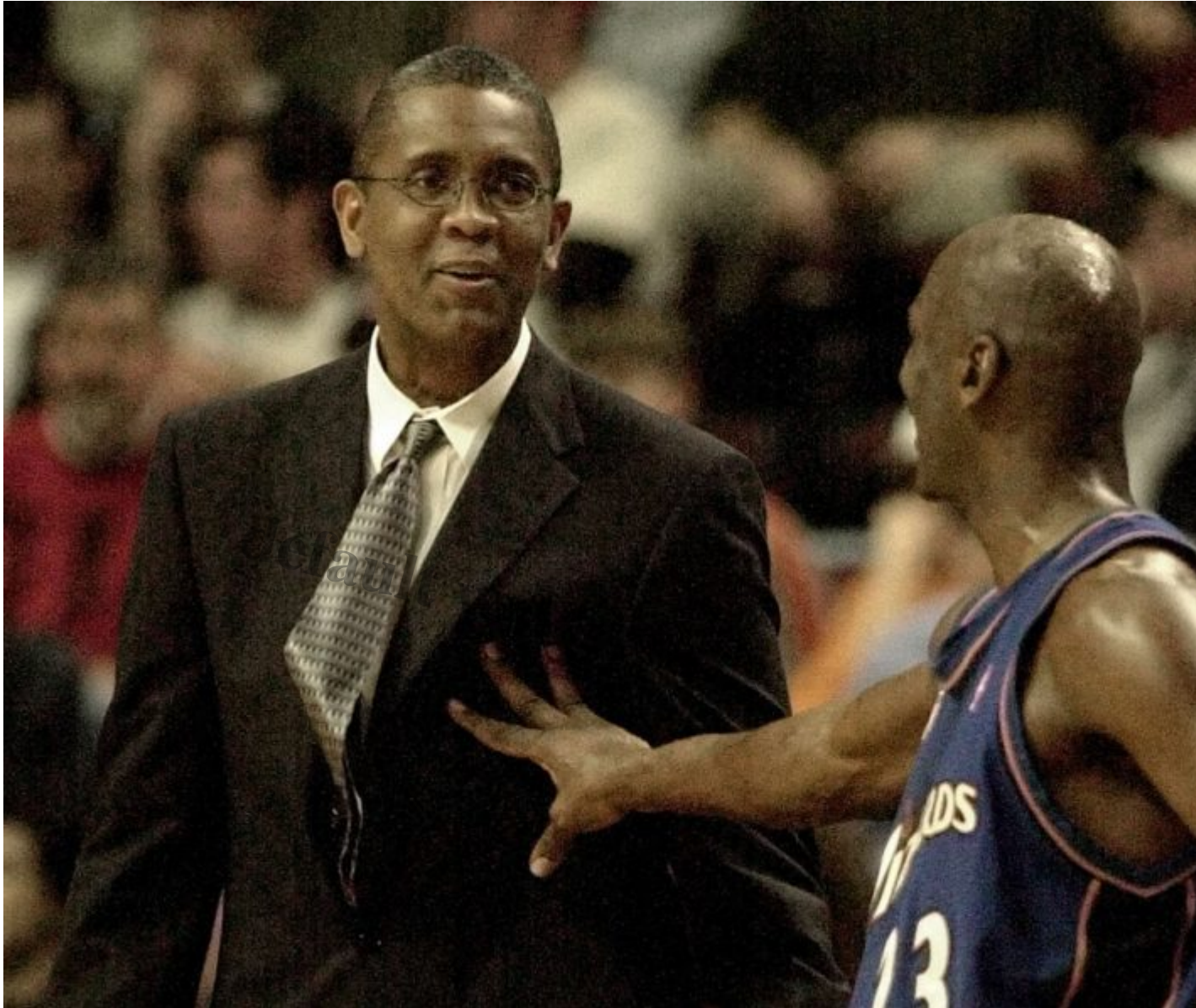
Cartwright in 2002 as assistant coach for the Chicago Bulls, with player Michael Jordan.

The Bulls had been whipped by the Detroit Pistons for two years. That changed, Cartwright said, when Phil Jackson came on as head coach for the 1989-1990 season and Michael Jordan started making big scores. Cartwright's role changed, too, to defense. "They didn't need me to score and I was okay with that. To win, you have to understand and accept your role, and play it as best you can."