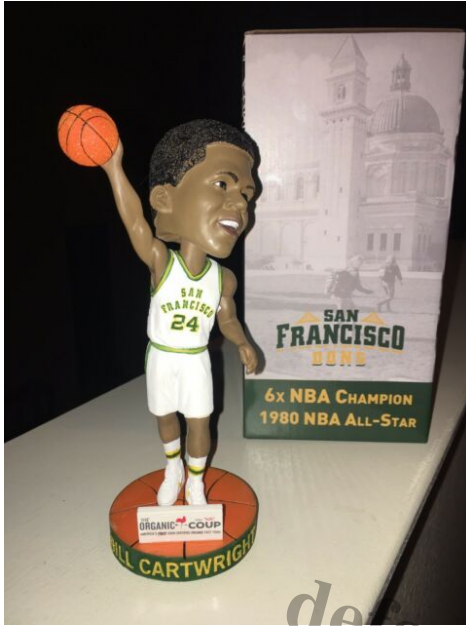
The "Dons" bobblehead.

When it came time to choose among offered college scholarships, he and his parents carefully assessed coaches. USF won him over: "I really connected with the coach and the players," he said. At USF, in one of the tallest starting lineups in collegiate history, Cartwright was named a consensus All American player in 1977 and 1979. He graduated as the all-time leading scorer for the Dons, leading USF to three NCAA tournaments.