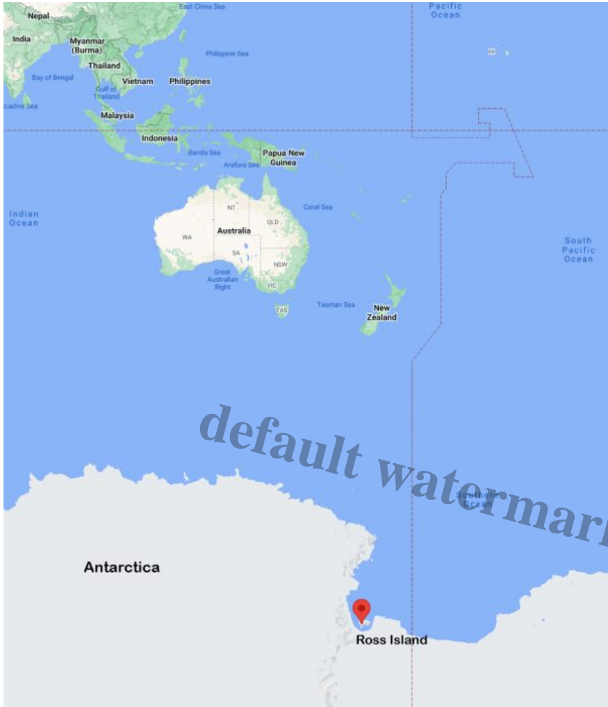
Ross Island, Antarctica.

At the same time, the landlord of the SRO she rented near Union Square, an immigrant from Thailand, urged her to consider retirement in his home country. The people were friendly, he said. It boasted a rich culture and natural beauty while its location and airports allowed easy access to other Southeast Asian countries.