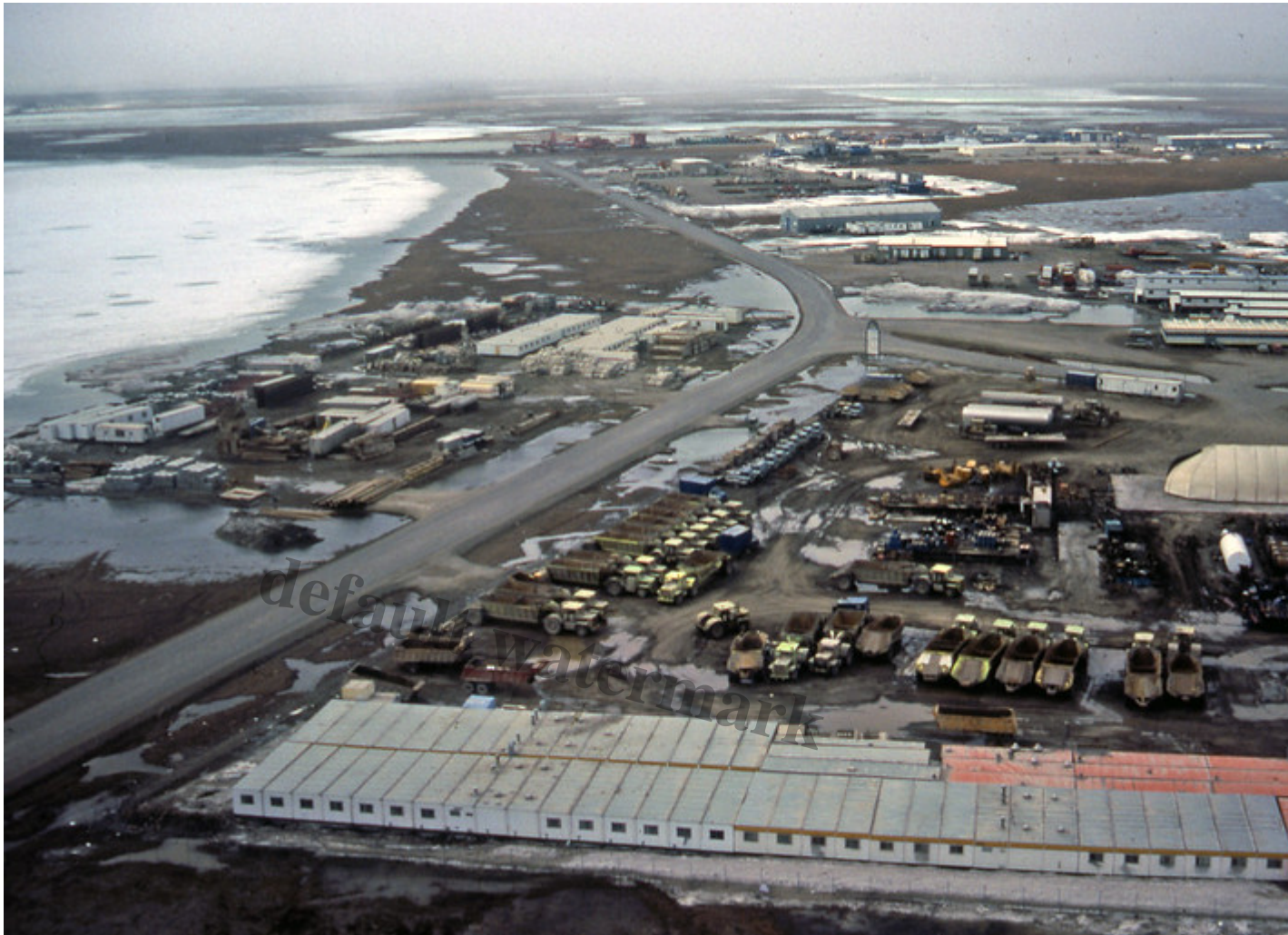
Alaska Prudhoe Bay Oil Field and Arctic Tundra Wilderness.