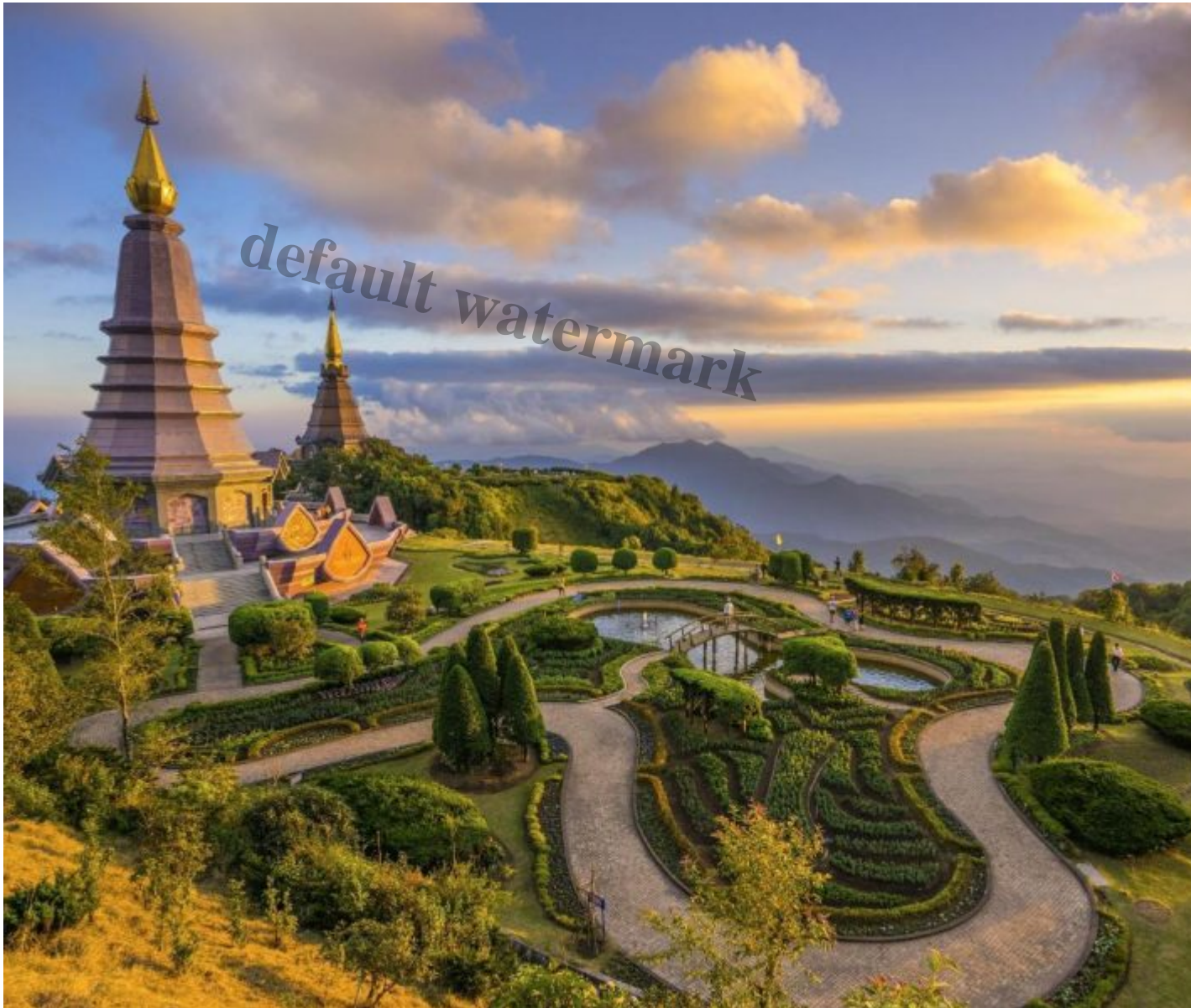
One of many temples in Chiang Mai, Thailand.

But then her travels stopped: While visiting Southern California, the pandemic hit. She stayed with her family for more than a year before being able to return to San Francisco, where she got a part-time at the Curry Senior Center .