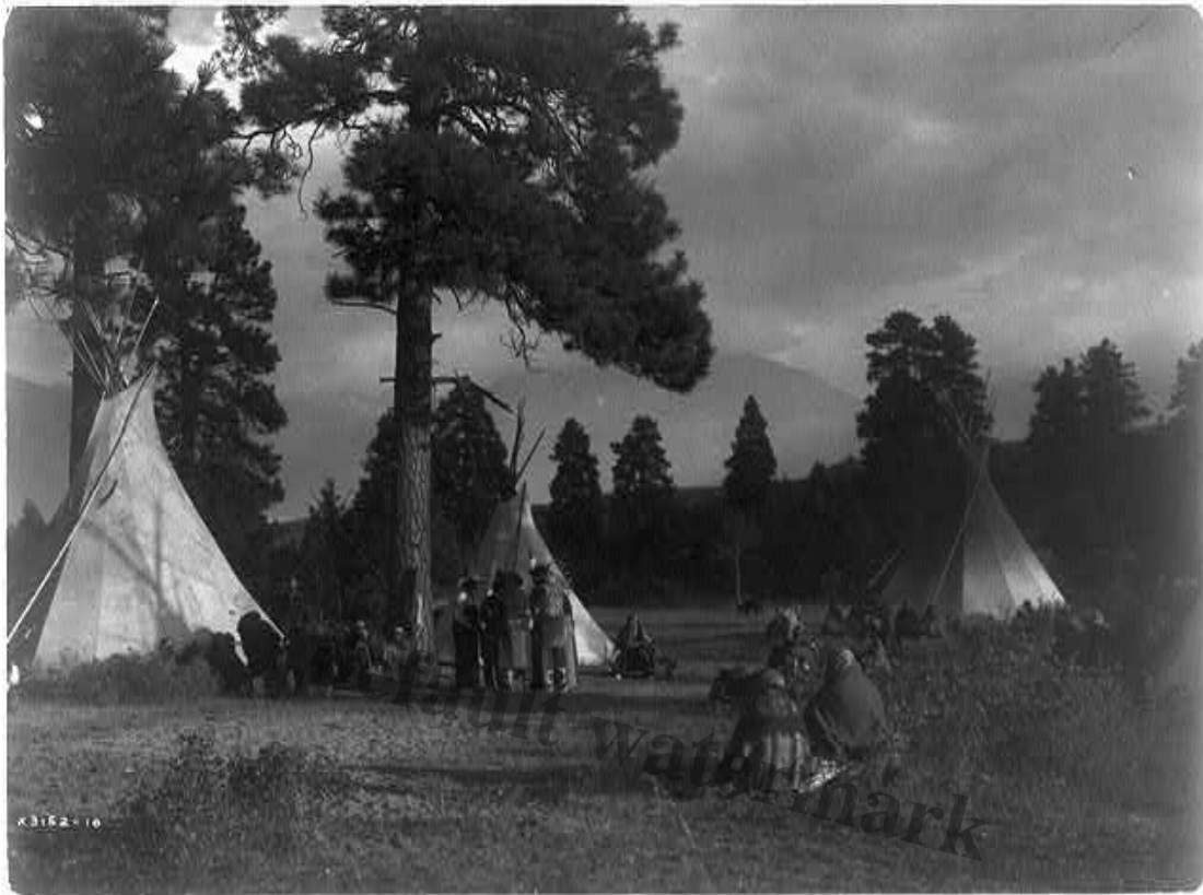
Men and women of the Flathead Indian tribe around 1910 on the Jocko River, a roughly 40-mile tributary of the Flathead River in western Montana. The Rocky Mountains are in the background.

The valleys and plateaus west of the Rocky Mountains, which later became British Columbia and the U.S. states of Washington, Oregon, and parts of Idaho and Montana was then called Oregon Country . Originally claimed by Great Britain, France, Russia, and Spain, the United States and Great Britain took joint control for 10 years under the Treaty of 1818, which allowed free trade and opened the lands to claims.