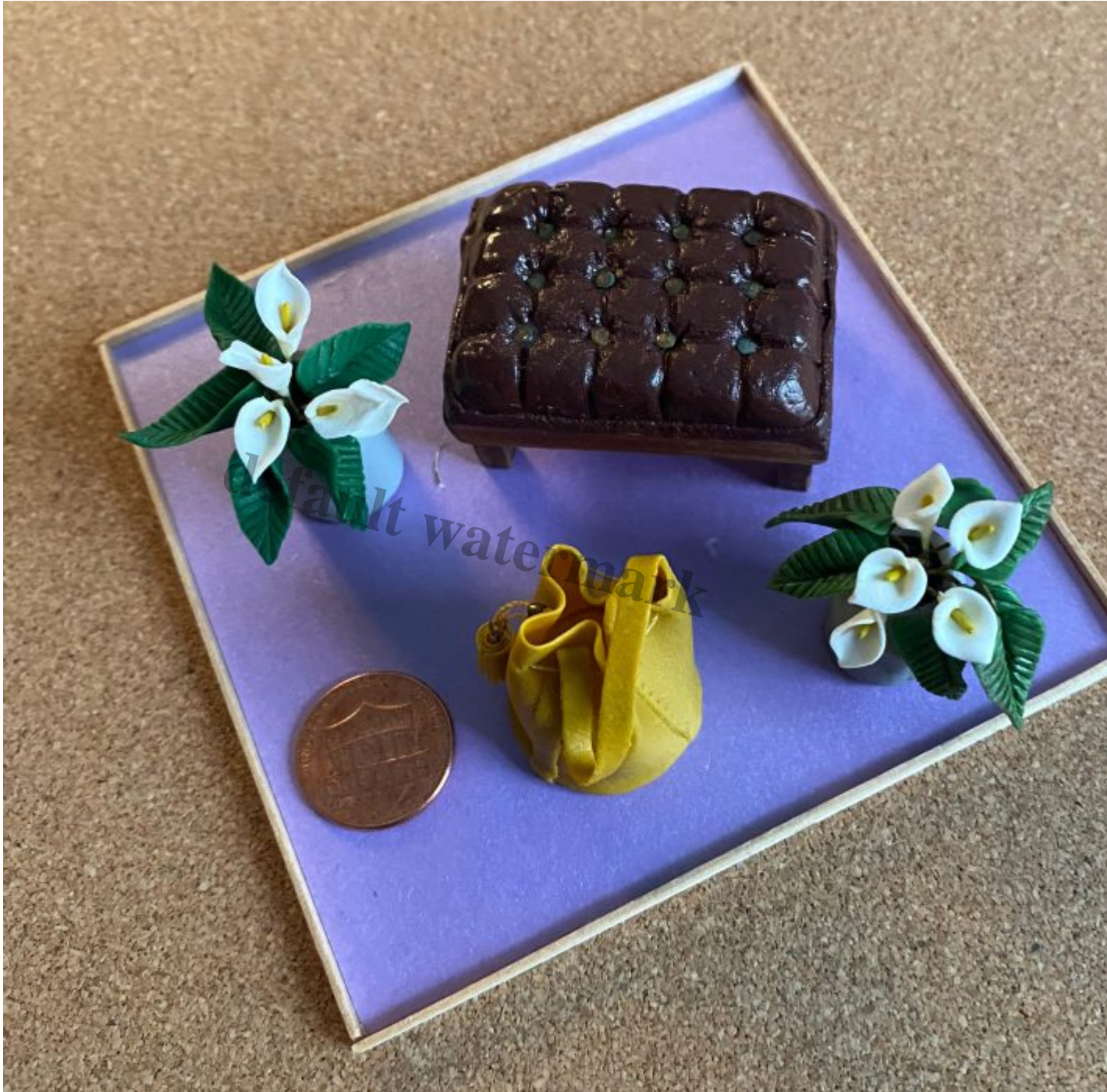
A miniature of a women’s Italian leather handbag, sitting on the floor next to a footstool, was made of Fimo clay.

The holidays are another chance for Lew to make use of her talents. She fills the shelves of a foot-tall, pine-tree-shaped cardboard box – a sort of winter dollhouse – with miniature paper nativity scenes, tiny pine trees, and ornaments. With the tree as the centerpiece, she creates a festive diorama.