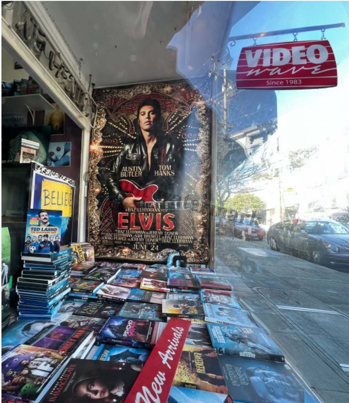
Video Wave on 24th Street in Noe Valley.

Like a streaming service, Video Wave runs on a subscription basis. The monthly fee is $8, which includes one free rental. Additional rentals cost $6 to $8. Some of his customers rarely rent a movie but continue to make regular payments. It's their way of supporting the store, Hutton said.